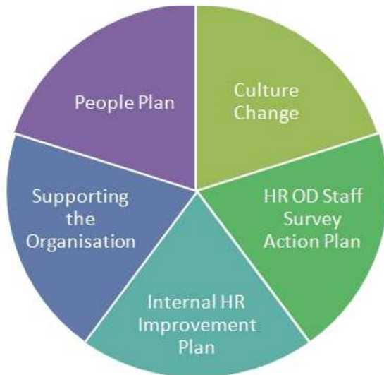
Figure 1: HROD Business Plan Priorities

We will Support the Organisation by providing a professional, responsive HROD function that supports the organisation and our partners in the management and robust performance of services and staff.